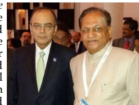
Our Chairman with Shri Arun Jaitley Finance Minister of India

He has contributed significantly to promote the field of finance in the last over three decades through education and research. One of his most important contributions is to found the prestigious Indian Institute of Finance in