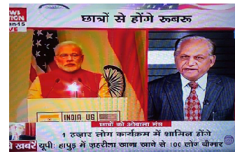
Our Chairman on NewsNation TV