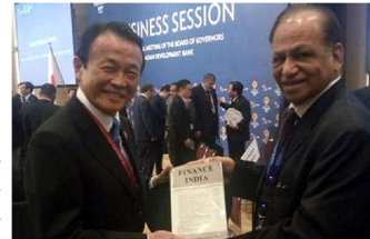
Our Chairman with Mr. Taro Aso, Deputy Prime Minister & Finance Minister of Japan (May 2017)

Faculty travelled widely to lecture or address conferences in 50+ countries from North to South, East to West including USA, UK, almost whole of Western & Eastern Europe, Russia, Uzbekistan, Japan, China, Australia, East Asia, Fiji, Brazil, Chile and Africa. Provided academic assistance to 100+ Universities/Institutions.